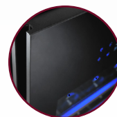
FULL GLASS DOOR

* Capacities are approximate and calculated with bordeaux bottles type.